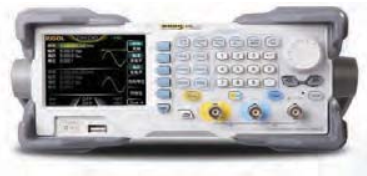
DG1000Z Series Arbitrary Waveform Generator

Compare vs Tek DS02000 and Agilent DSOX2000A