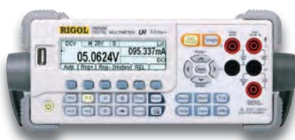
DM3000 Series Digital Multimeter

The Model DM3058E DMM gives reliable, cost effective, full DMM capabilities measuring DCV, ACV, DCI, ACI, Resistance (2 & 4 Wire), Capacitance, Diode Test, Frequency, and Temperature. These DMMs are designed for simple and efficient bench top use, but include software options for datalogging and remote programming from almost any interface. The DM3058E is the perfect choice for engineering labs.