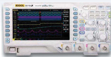
DS1000Z Series Digital Oscilloscopes

Models are available at 50MHz through 100MHz, with 1GS/Sec Sampling, up to 24MPts of memory and a Multi-Level Intensity Graded, 7" WVGA display. The DS1000Z Series of Digital Oscilloscopes is the perfect choice for educators needing an advanced analysis oscilloscope. Available options like 16 channel logic analysis, serial decode and an integrated 2 channel source make this a powerful analysis tool.