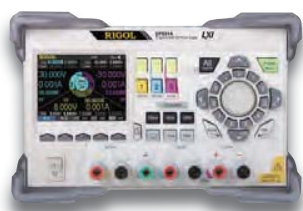
DP800 Series Programmable Power Supplies

Compare vs Tek AFG3000 and Agilent 33500B